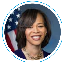
LISA BLUNT ROCHESTER Delaware's At-Large Congressional District United States House of Representatives