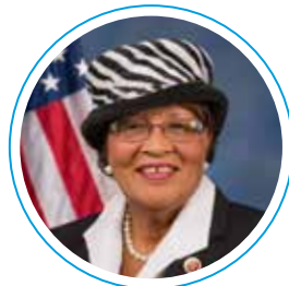
DR. ALMA S. ADAMS 12th Congressional District of North Carolina United States House of Representatives