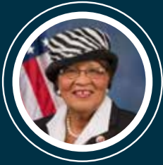
DR. ALMA S. ADAMS 12th Congressional District of North Carolina United States House of Representatives