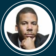
MR. TOM JOYNER JR. President & CEO Tom Joyner Foundation