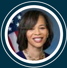
DR. LISA BLUNT ROCHESTER Delaware's At-Large Congressional District, United States House of Representatives